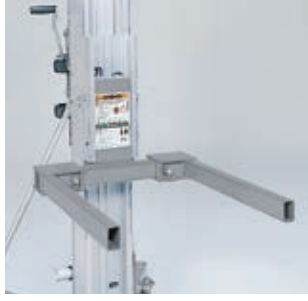
ADJUSTABLE FORKS widen from 11 to 30 in (28 to 76 cm) to accommodate diverse loads.