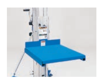
LOAD PLATFORM fits over the forks to handle odd-sized or heavy objects - no tools required for installation.