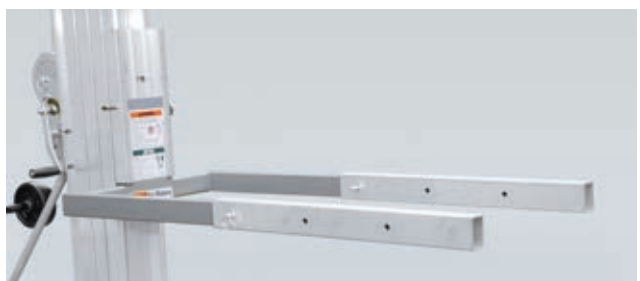
FORK EXTENSIONS insert onto standard forks for an additional 25 in (64 cm) of length.