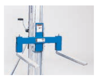
FLAT FORKS, which widen from 16 to 31 in (41 to 79 cm) to provide proper support, allow you to easily lift your load off of flat surfaces.