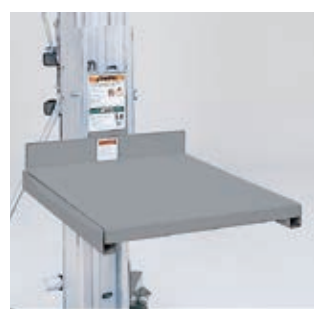
LOAD PLATFORM fits over the forks to handle odd-sized or heavy objects — no tools required for installation.