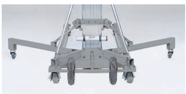
Support for Heavy Loads

The captive stabilizer with patented "locking system" provides additional lateral support for heavy loads (standard on Genie SLC™-18 and SLC-24).