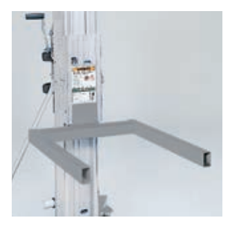
STANDARD FORKS accommodate various loads for versatile lifting. Get an additional 21 in (53 cm) of lift by turning over and re-pinning the forks.

A variety of load handling accessories make this unit extremely versatile.