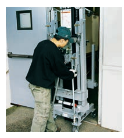
The compact stowed position makes the Super Tower lift easy to move through doors and load on trucks with no bulky base to get in the way. Stowed dimensions are 22 in (56 cm) by 25.25 in (64 cm).