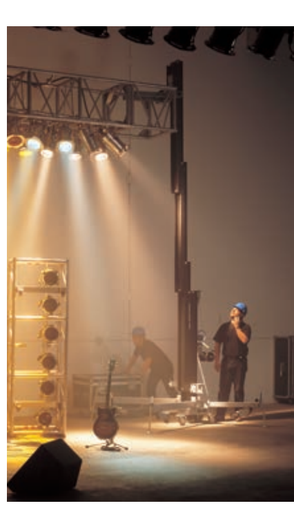
Quick, Simple Setup Just install the outriggers and set the leveling jacks.

The ideal choice for lifting and supporting lighting/sound systems and stage scenery while blending in backstage.