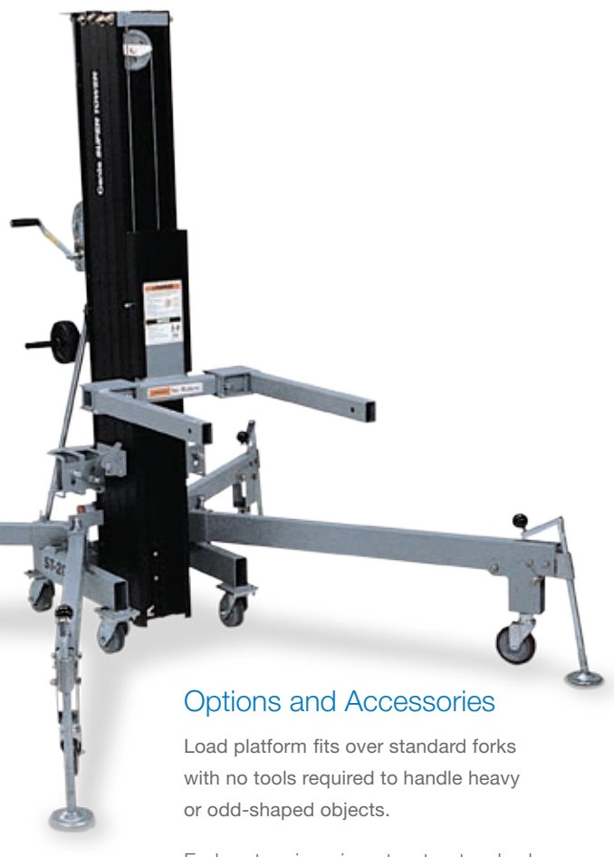
Fork extensions insert onto standard forks for an additional 25 in (64 cm) of length.

The Genie® Super Tower™ material lift is the industry standard for theatrical productions and entertainment events. It telescopes lighting, sound systems and scenery weighing up to 800 lb (363 kg) and can lift to heights up to 26 ft .5 in (7.94 m). And the standard flat black anodized finish blends in perfectly backstage, making it virtually invisible to audiences. It's also compact and portable for easy transport and storage.