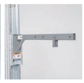
BOOM OPTION transforms your lift into a mobile, vertical crane or hoist to position tooling fixtures, circuit breakers, engines and more.